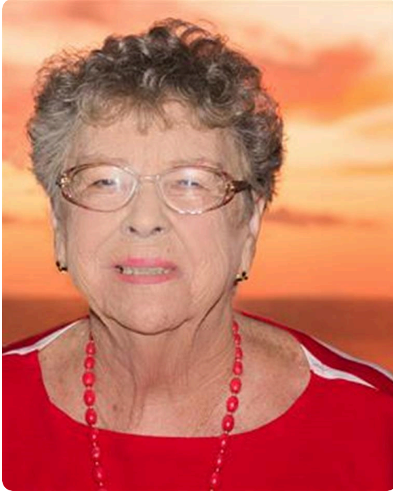
Celebrating her 90th Birthday!